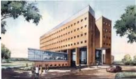
Pharmacy School (2014)